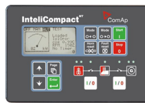
ComAp IntelliCompact NT SPTM