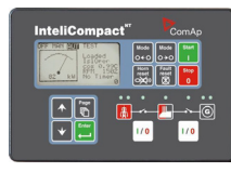
ComAp IntelliCompact NT SPTM