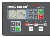
ComAp IntelliCompact NT SPTM