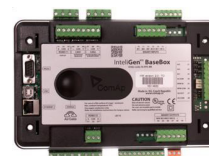
ComAp IntelliGen 200