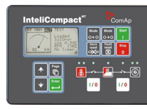
ComAp IntelliCompact NT SPTM