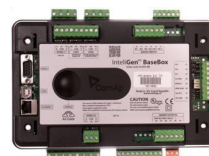
ComAp IntelliGen BaseBox