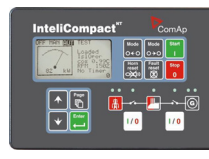
ComAp IntelliCompact NT SPTM