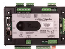
ComAp IntelliGen 200