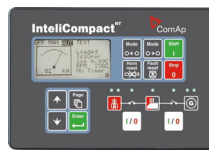
ComAp IntelliCompact NT SPTM