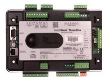
ComAp IntelliGen 200